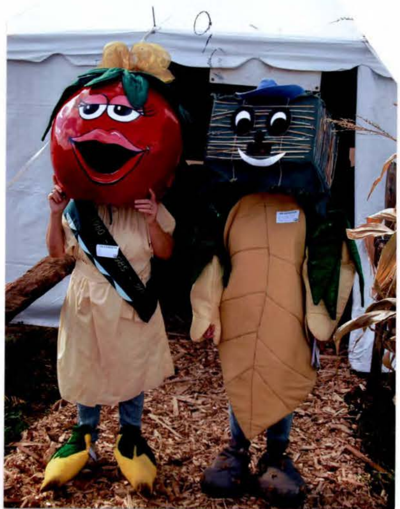
I "ELLY" MASCOT for Plowing Match and 2 "ELGIE"

2010 INTERNATIONAL PLOWING MATCH Grand Opening Luncheon Tuesday, September 21, 2010