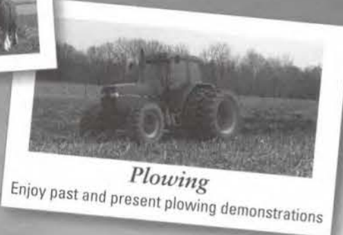
Plowing Enjoy past and present plowing demonstrations