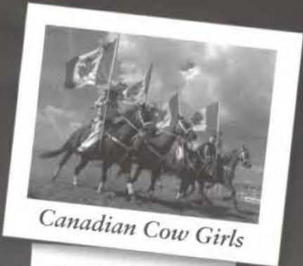
Canadian Cow Girls