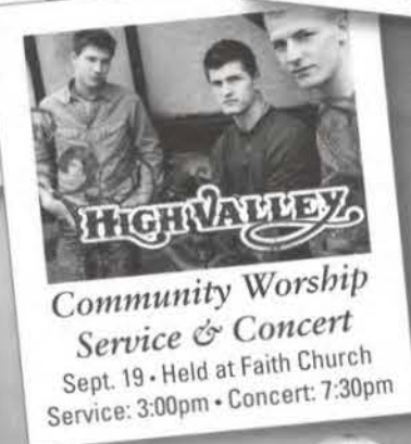
HIGH VALLEY Community Worship Service & Concert Sept. 19 • Held at Faith Church Service: 3:00pm • Concert: 7:30pm