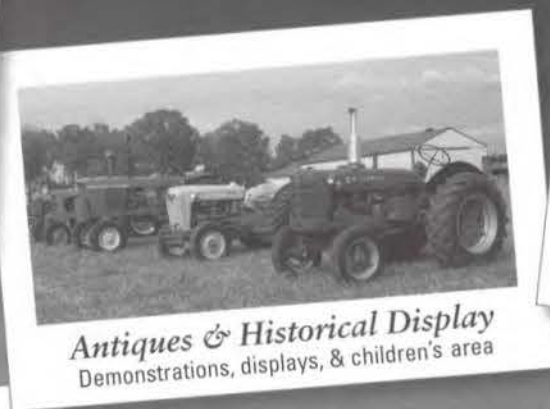
Antiques & Historical Display Demonstrations, displays, & children's area