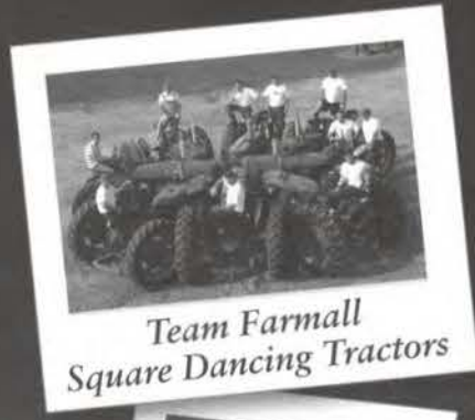
Team Farmall Square Dancing Tractors