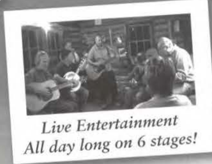
Live Entertainment All day long on 6 stages!